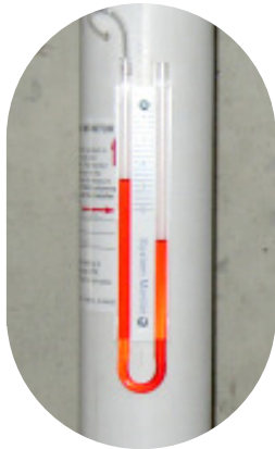
A common gauge found on radon mitigation systems is a U-tube filled with red liquid called a manometer or vacuum gauge.

The U-tube manometer or vacuum gauge primarily indicates the vacuum pressure inside the radon mitigation system. This will let you know if the radon mitigation fan is working properly.