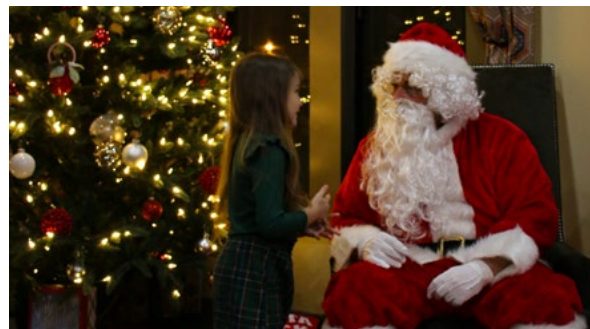
Home for the Holidays