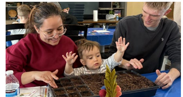
Earth Day Gardening Class