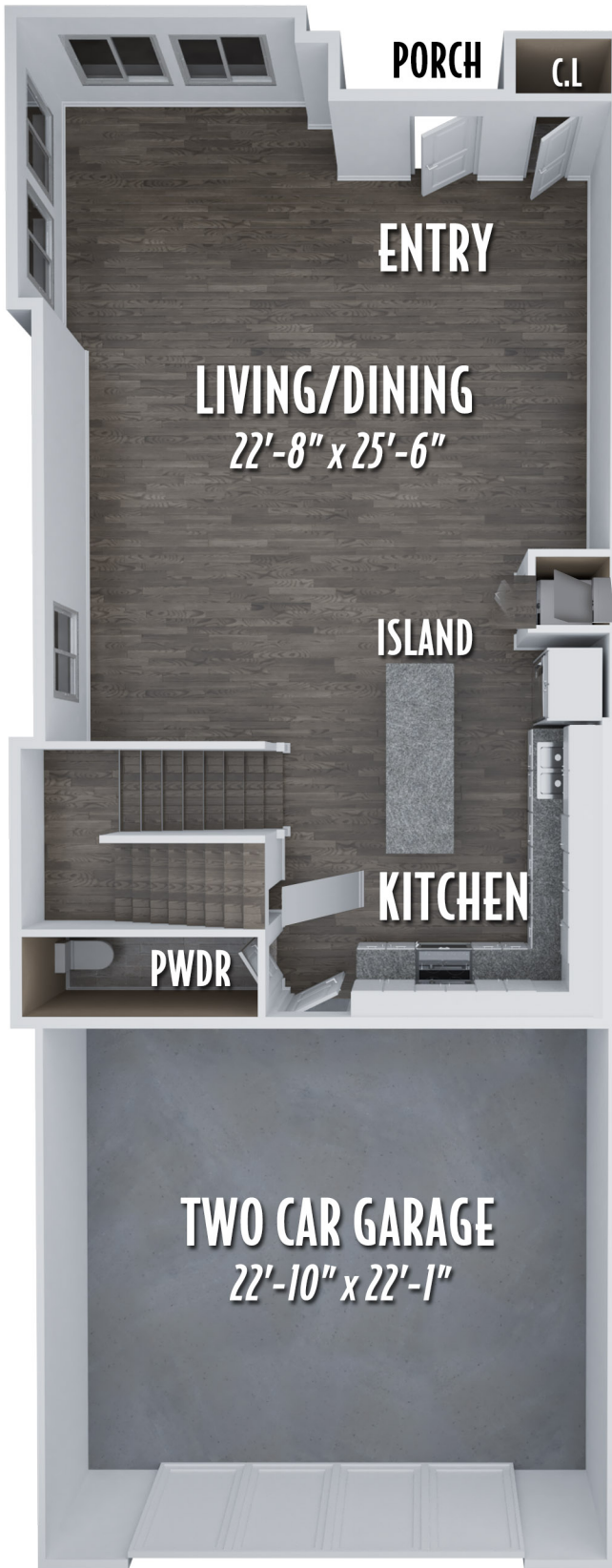
FIRST FLOOR 956 SQ. FT.