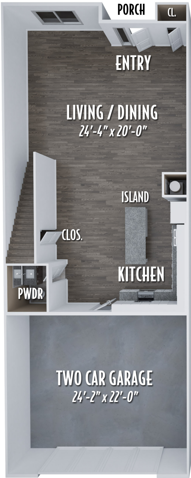
FIRST FLOOR 1,030 SQ. FT.