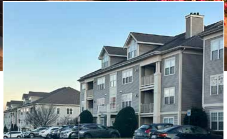
Stoneridge Condominium - Page 9