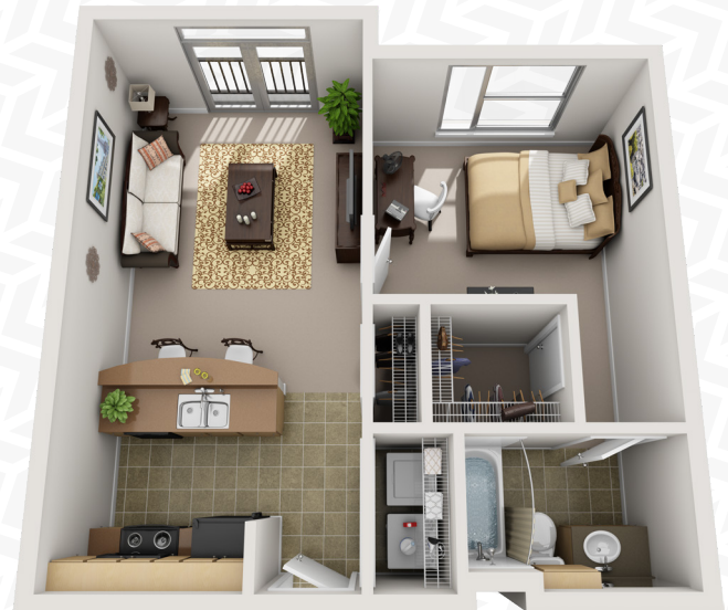
A2: Tiger 601 Square Feet