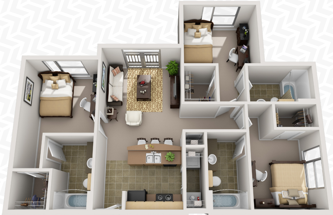
C1: Union 1,064 Square Feet

Current rates can be found on our website. Contact the Leasing Office for more details. SQFT listed is an approximate value for each floor plan.