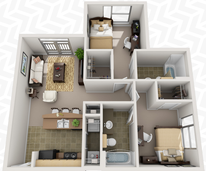
B2: Lousiane 816 Square Feet

Current rates can be found on our website. Contact the Leasing Office for more details. SQFT listed is an approximate value for each floor plan.