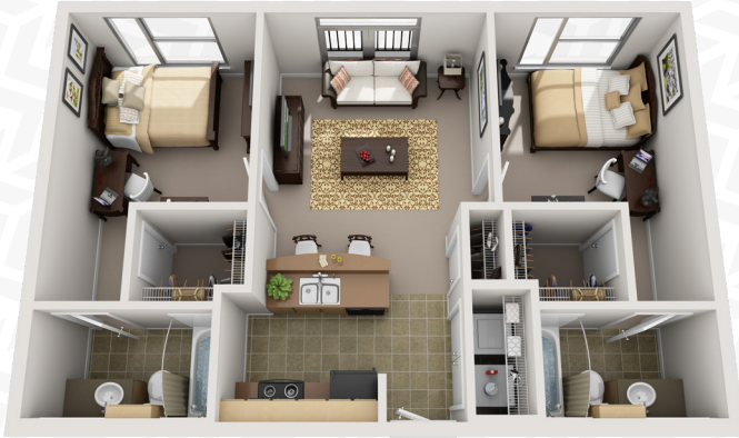
B1: Tradition 733 Square Feet