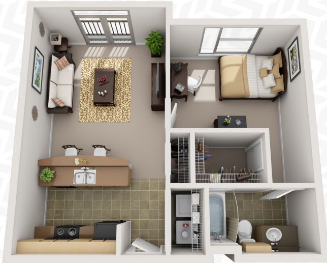
A1: Red Stick 548 Square Feet