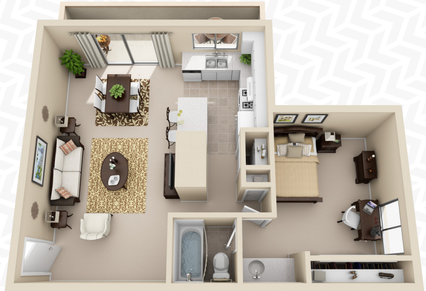
1 BED / 1 BATH 701 Square Feet

Current rates can be found on our website. Contact the Leasing Office for more details. SQFT listed is an approximate value for each floor plan.