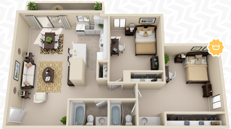
2 BED / 2 BATH 1,003 Square Feet