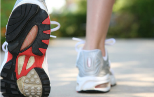
Ample Walking Areas