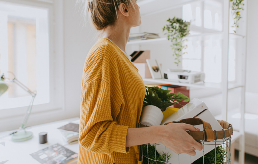
Updated Lighting Fixtures