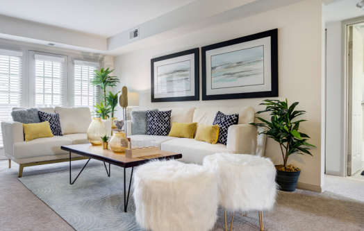
Spacious Open Floorplans