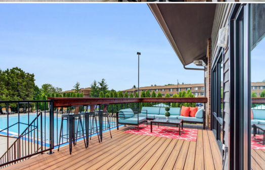
Double Pool Deck