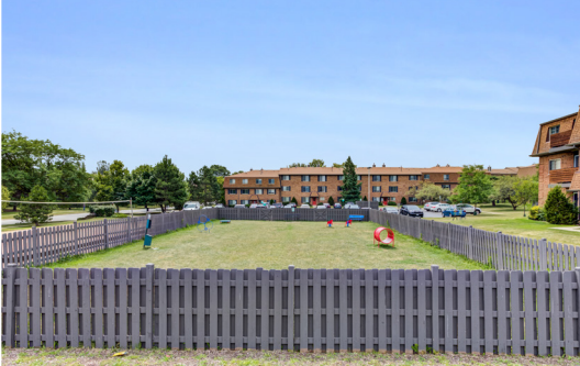
Off-Leash Dog Park