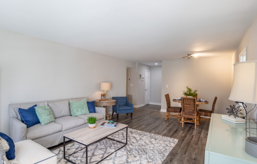
Fully Renovated Interiors