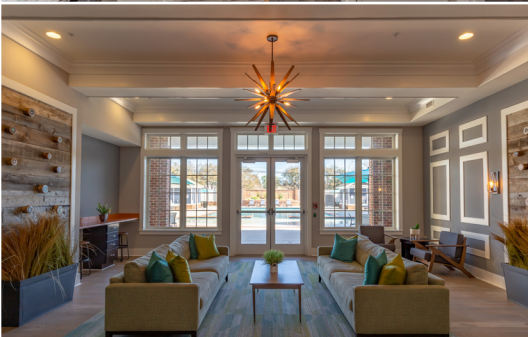
Clubhouse with Lounge