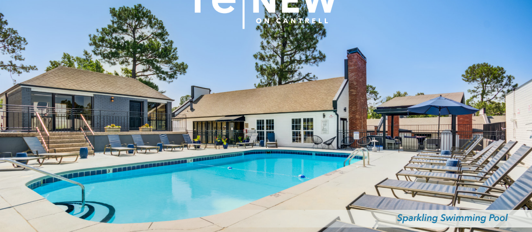
Sparkling Swimming Pool