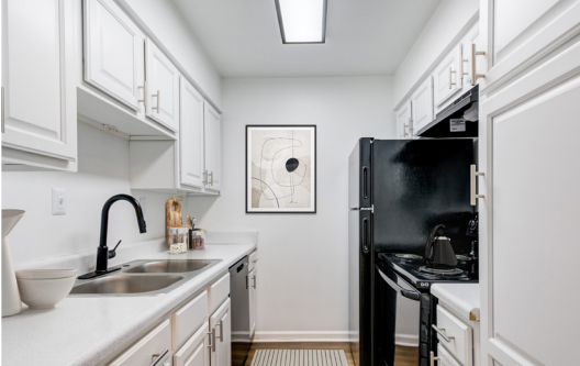
Fully Equipped Kitchens