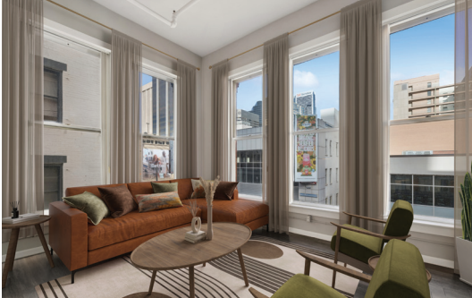
Modern Flooring and Fixtures