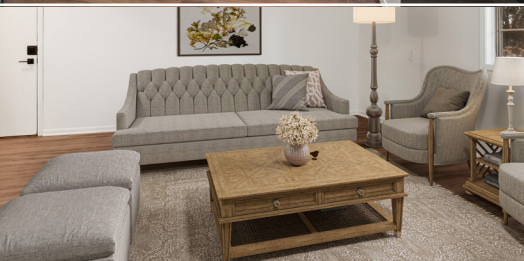
Comfortable Livingroom Area