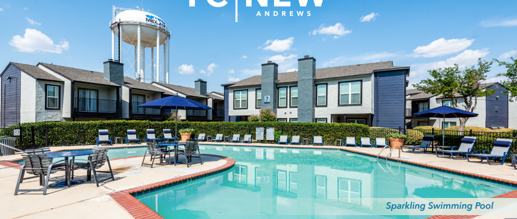
Sparkling Swimming Pool