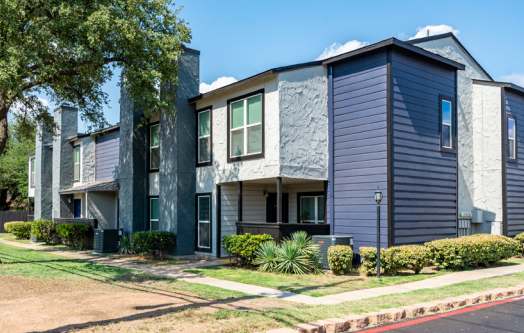
Native Plant Landscaping