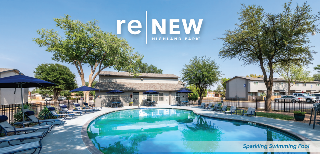
Sparkling Swimming Pool