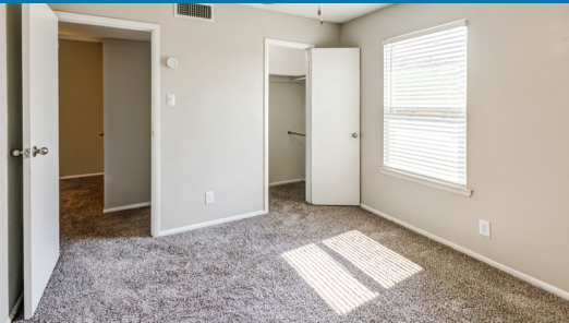
Spacious Open Floorplans

ReNew Highland Park sits in the heart of North Midland, offering residents the perfect balance of urban convenience and natural beauty. Home to thoughtfully designed 1, 2, and 3-bedroom apartments with spacious layouts, private outdoor spaces, and in-unit laundry connections, every detail has been crafted with your comfort in mind. ReNew Highland Park's prime location provides easy freeway access throughout the city, making it easy to reach downtown Midland, the business districts, and everything the city has to offer. Our curated amenities complement your daily life with a sparkling swimming pool and sundeck, basketball courts, bark park, clubhouse with TV lounge, and business, creating the perfect blend of recreation and relaxation right at home.