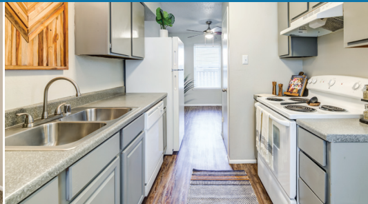
Newly Renovated Interiors