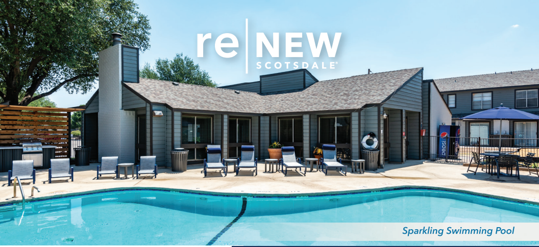
Sparkling Swimming Pool