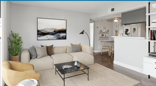
Newly Renovated Interiors