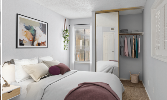
Newly Renovated Interiors