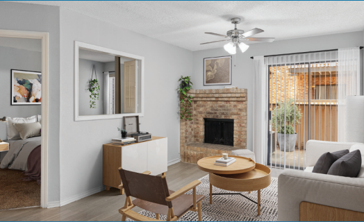
Spacious Open Floorplans

Our modern apartment community offers studio, 1, & 2-bed apartments designed to fit your lifestyle, complete with townhome-style living that provides the privacy and space you deserve. With quick access to the freeway, grocery stores, and nearby amenities, you can rest easy knowing we are conveniently located to all your necessities, including popular retailers like Market Street and United Supermarkets for your weekly shopping needs. Residents enjoy premium amenities including a refreshing pool and sundeck, convenient business center, bark park for your four-legged family members, and in-unit features like private patios, fireplaces, and washer/dryer connections. Our pet-friendly community welcomes both you and your furry companions, offering 24-hour availability, on-site management and maintenance, plus modern conveniences like package receiving and electronic payment options to make your life easier.