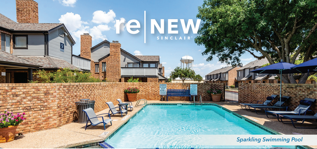
Sparkling Swimming Pool