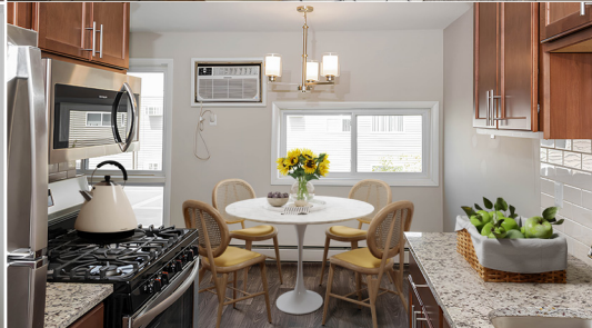
Spacious Open Floorplans