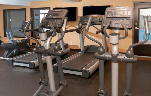
State-of-the-Art Fitness Center