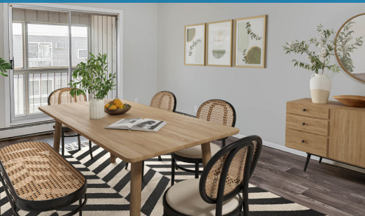
Fully Renovated Interiors