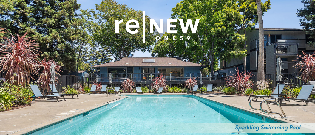
Sparkling Swimming Pool