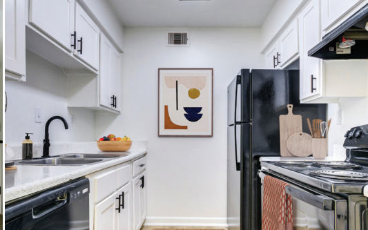
Fully Equipped Kitchens