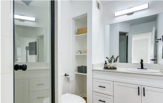
Sleek White Cabinetry