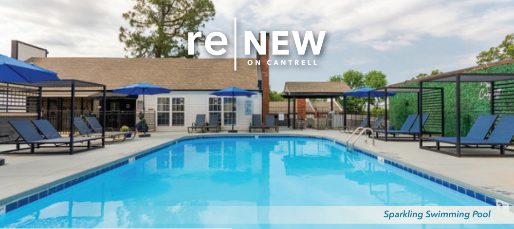
Sparkling Swimming Pool