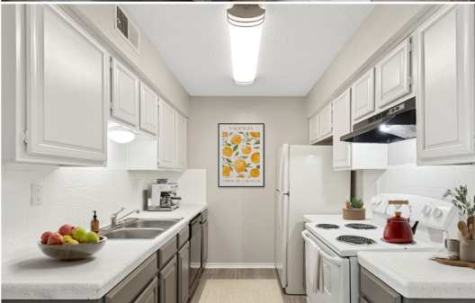
Fully Equipped Kitchens