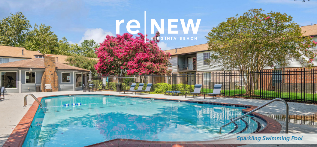
Sparkling Swimming Pool