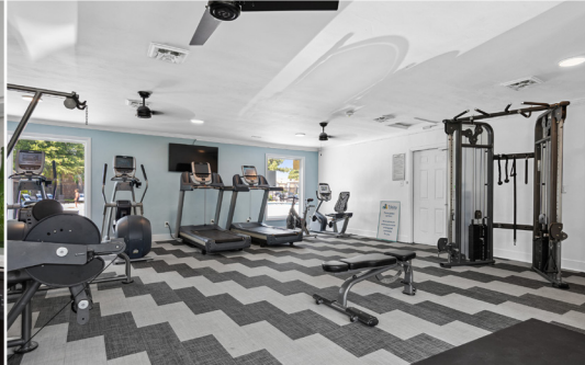
State-of-the-Art Fitness Center