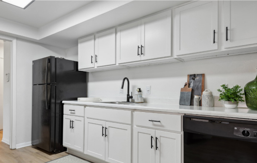
Fully Equipped Kitchens