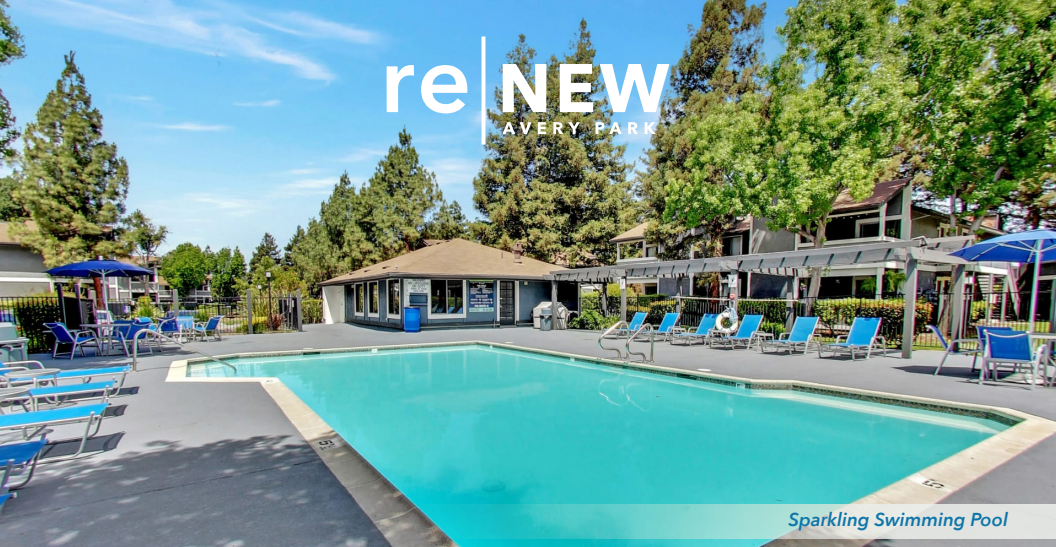
Sparkling Swimming Pool