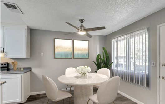
Separate Dining Area