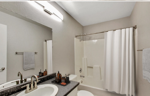
Fully Renovated Interiors