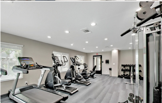
Fully Equipped Fitness Center

ReNewAveryPark.com • Call 707-862-8852 • Text 707-405-0010